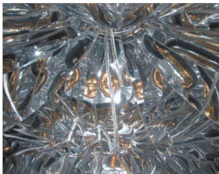
Physics equipment, such as this dark-matter detector, will compete with astronomy projects.