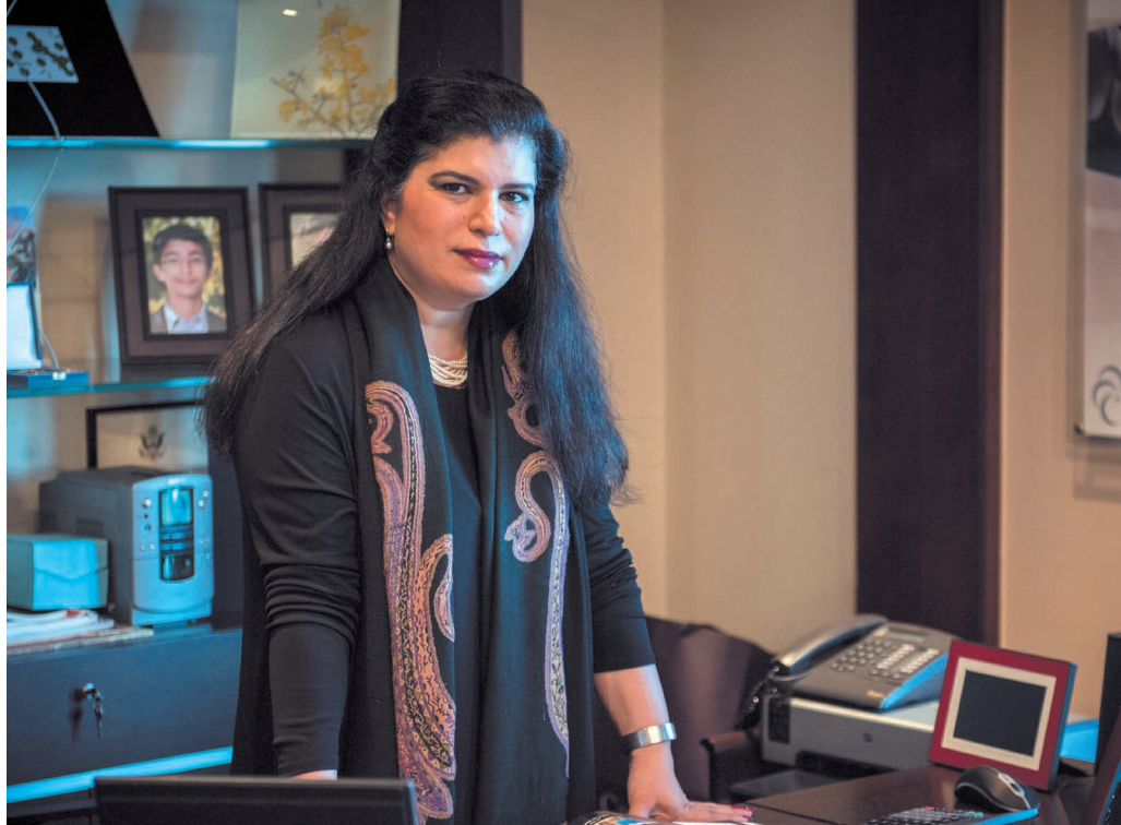
Princess Sumaya bint El Hassan is one of Jordan's leading science advocates.