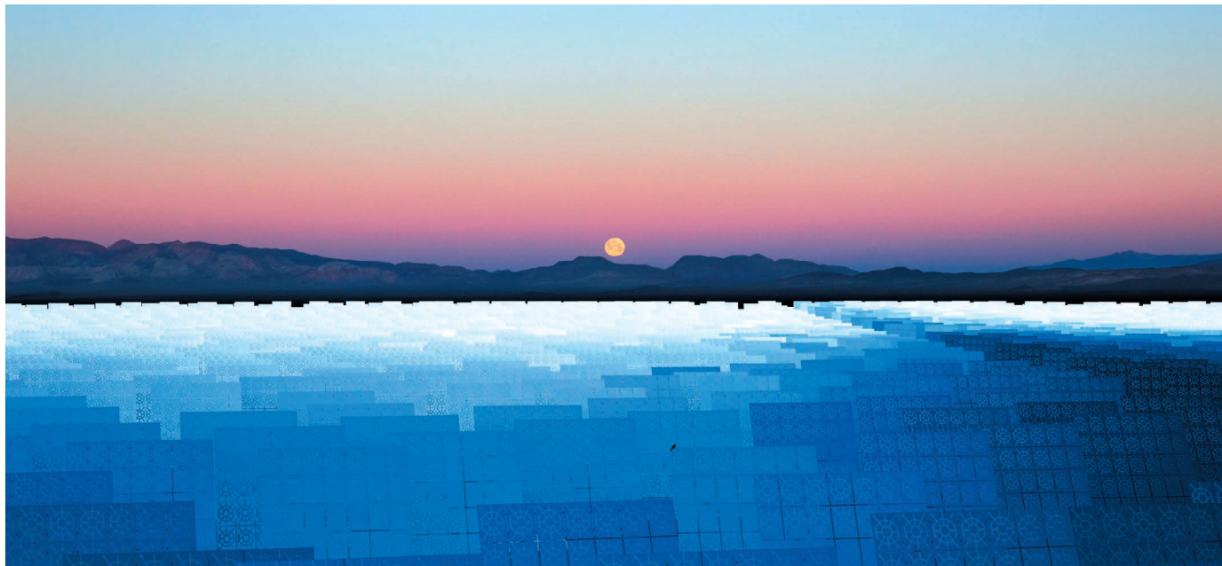
Decarbonizing the world economy will require renewable energy generation from vast solar farms, such as this one in Nevada.