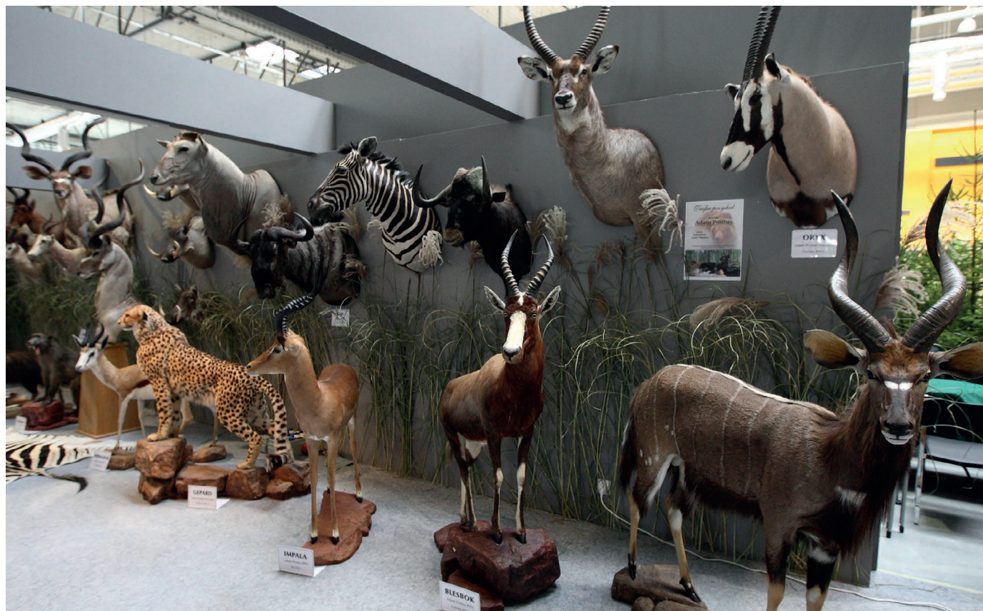
Developments in taxonomy could see safari hunters killing 25 types of antelope, instead of the previous 9, to achieve the ‘spiral horned grand slam’.

For instance, agreed differences in calls and songs could help to delineate species of birds and primates; for fungi, genetic barcodes could be used. Such differences must be explicitly stated and agreed.