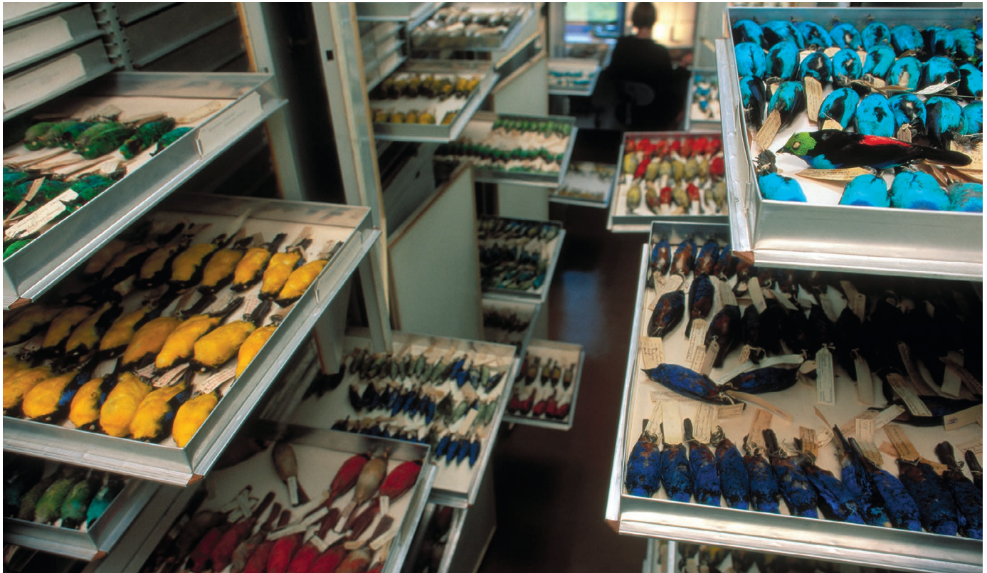
Part of the vast ornithology collection at the American Museum of Natural History.