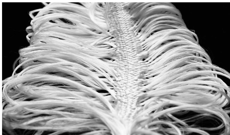
High-capacity (HiCap) polymers can separate metals such as uranium from solution.