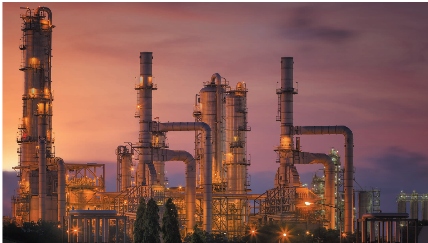
Refineries use huge amounts of thermal energy to process crude oil.