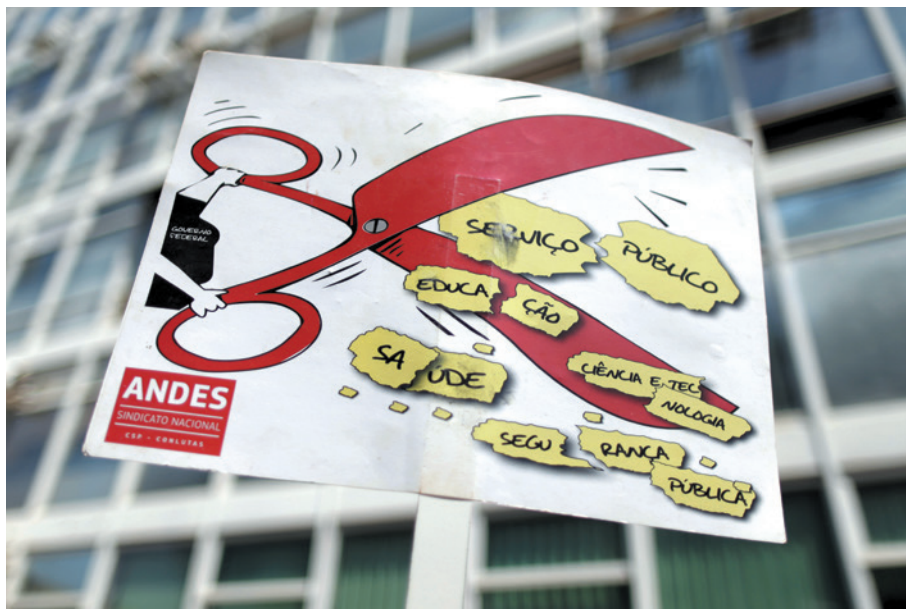
Proposed cuts to government spending have provoked demonstrations in Brasilia.