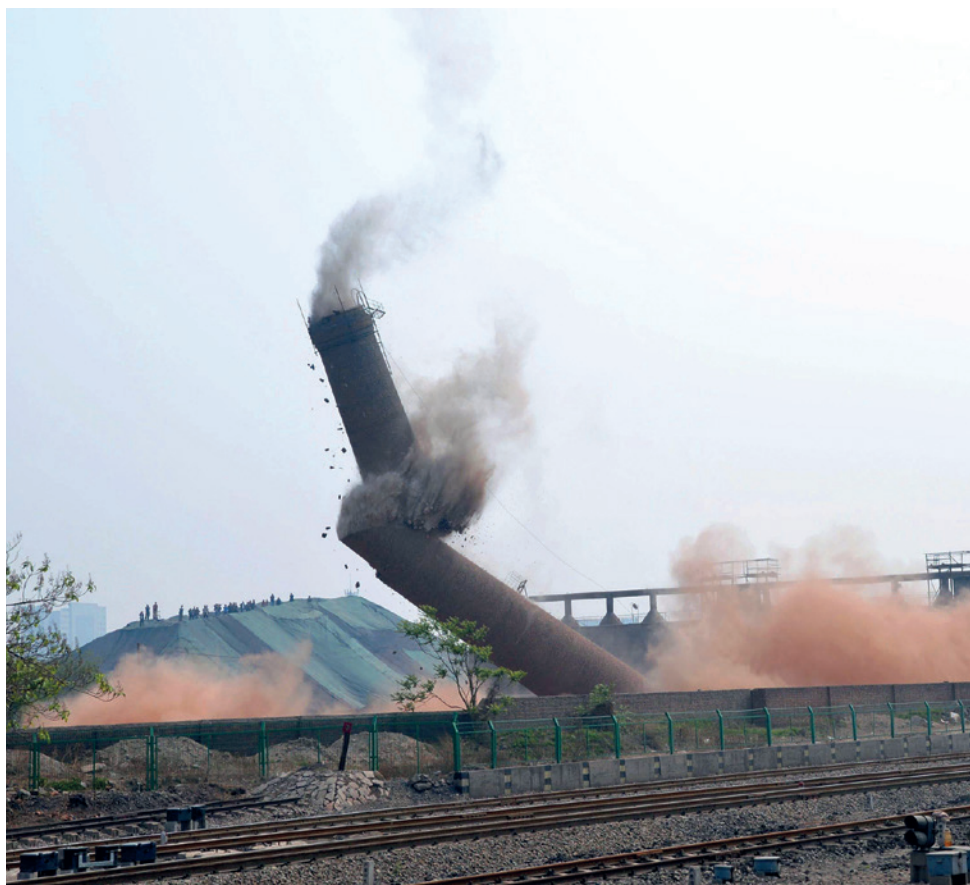
Fossil-fuel factories are demolished in China's Hebei province.

Full author affiliations accompany this article online at go.nature.com/fihq6v