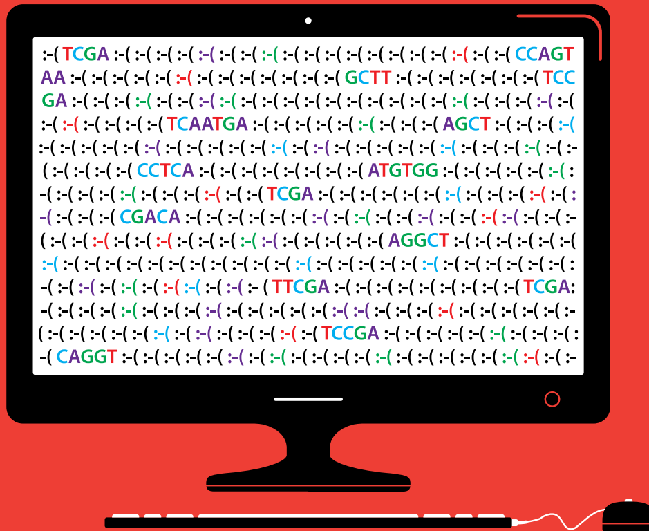
ILLUSTRATION BY DENIS CARRIER

FUNDING Grant applicants deserve to see full expert feedback p.198