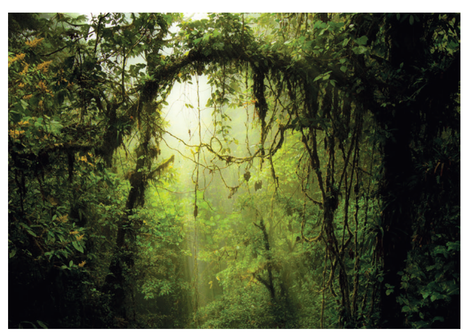
Conservation efforts risk getting snared in a tangle of aims.