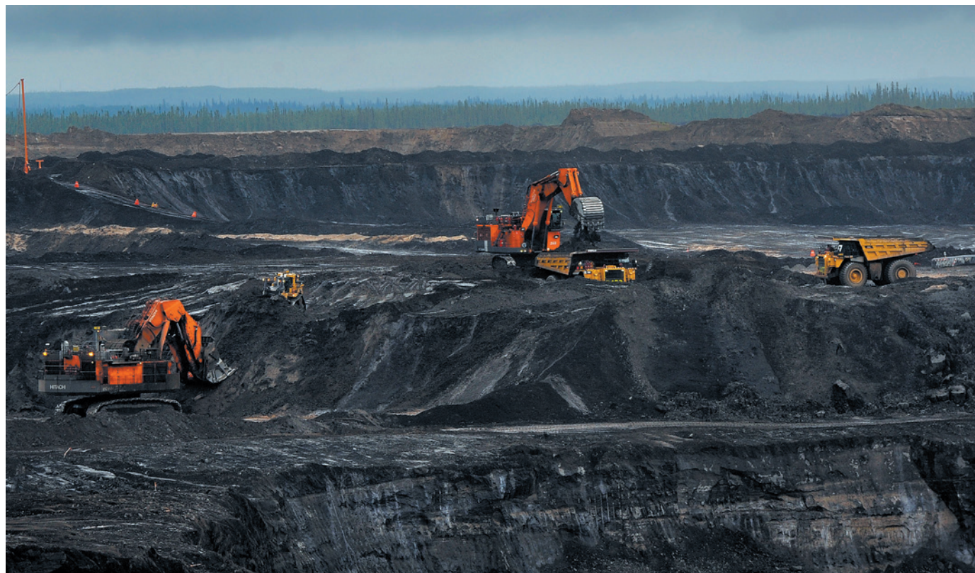
Oil extracted from fields in Alberta, Canada, would travel through the proposed Keystone XL pipeline.