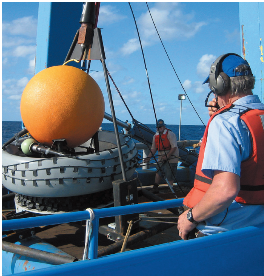
Hydrophones run by the Comprehensive Nuclear-Test-Ban Treaty Organization track explosions in the sea.

Duncan's team found the signal while analysing data from an acoustic station in Perth Canyon about 40 kilometres west of Rottnest Island near Perth. It is one of six stations operated by Australia's Integrated Marine Observing System (IMOS), which was set up to make physical, chemical and biological observations of the ocean basin. Duncan then confirmed the signal using data from an acoustic station off Cape