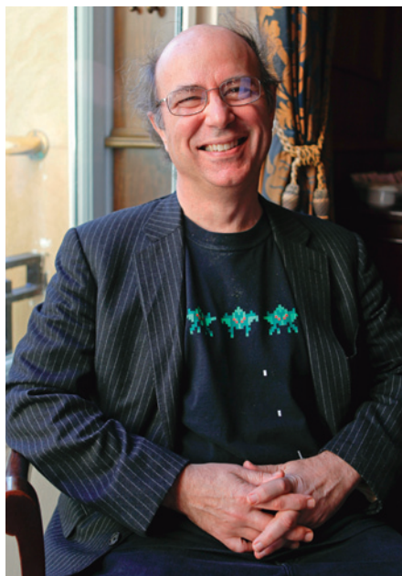
Frank Wilczek studies how fundamental particles respond to drastic changes in space-time.

Wilczek and his co-authors set up a hypothetical system with a single quantum particle moving along a wire that abruptly splits into two. The stripped-down scenario is effectively the one-dimensional version of an encounter