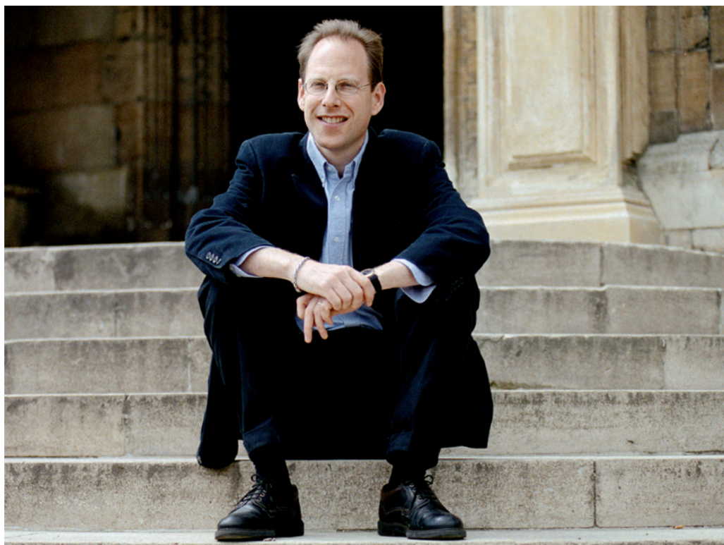
Simon Baron-Cohen noticed that children with autism are drawn to 'systems' such as machines and numbers.

Baron-Cohen cites several lines of evidence in support of his theory. In a 2003 study 3 , for example, he found that people with autism scored highly on the 'systemizing quotient', a questionnaire he designed. In a survey of undergraduates at the University of Cambridge, he found that those studying mathematics were more likely to have been