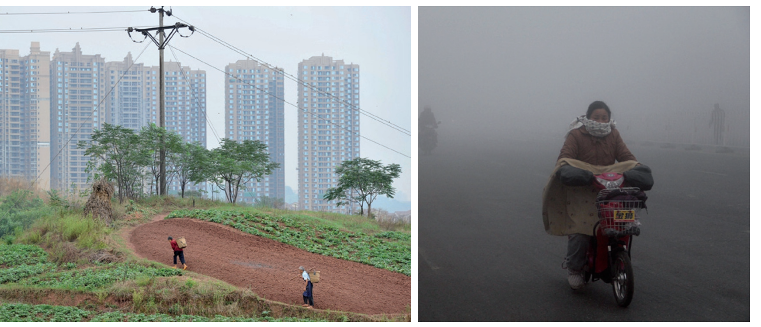
Most Chinese farms are tiny, making it hard to boost yields while reducing environmental costs such as air pollution.

and produce results that can be applied to China's diverse agricultural regions - from the subtropical wet south to the North China Plain and the cooler northeast — agricultural scientists are feeding information on climate, soil conditions, water supply and their variability into models. The 'optimal' genetic varieties and management approaches selected through modelling are evaluated by measuring factors such as the growth of crops and their uptake of nutrients, in experimental plots or in field studies. These measurements can then be used to improve the performance of the models, which in turn are used to further enhance yields<sup>4</sup> (see 'More for less').