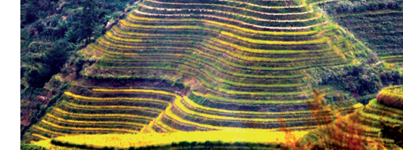
Terraced fields in China, where researchers are pushing crop yields close to their biophysical limits.