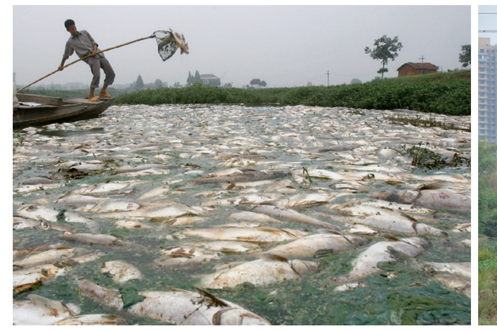
A lake in Hubei province clogged with algae, caused by excess fertilizer running off nearby fields.

In the face of such challenges, agricultural scientists in China are trying to boost yields of the nation's staple grains — maize (corn), rice and wheat — by analysing fields as ecosystems. In experimental plots and in field studies on farms, they are tracking inputs and outputs such as water, nutrients, genetic material, solar and fossil energy, and muscle power from humans and animals. For instance, by chemically testing rain and irrigation water and monitoring the amount of fertilizer or manure added, researchers can estimate the amount and types of nutrient entering the system. The various inputs and outputs are optimized, to produce the greatest yield for the least resources and the lowest nutrient losses, by manipulating conditions and approaches in