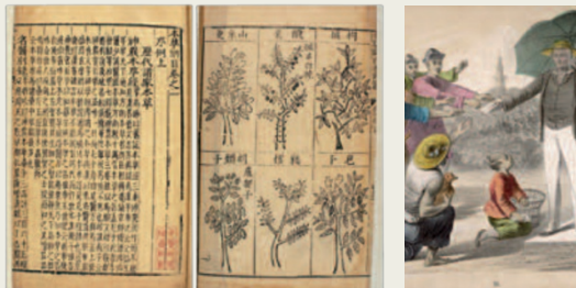
Two pages from Li Shizhen's TCM encyclopaedia.

The Qing dynasty collapsed in 1911 and the Republic of China was founded. Foreign powers had a big influence in China, and favoured a Western school of thought over TCM.