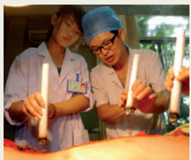
Below: A patient receives moxibustion in modern-day China.

The Qing dynasty collapsed in 1911 and the Republic of China was founded. Foreign powers had a big influence in China, and favoured a Western school of thought over TCM.