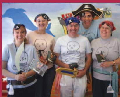
From left to right: Jolly Roger, Long John Silver, Bluebeard, Hook and Smee.