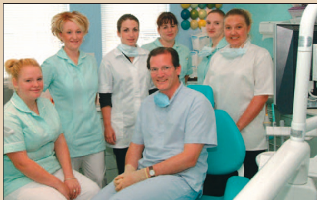
The team at Queensferry Dental Surgery, Flintshire, a BDA Focus Award winner

Again, the key is a close working relationship between dentist, hygienist and patient.