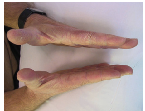
Fig. 1 Hyperkeratotic erythematous plaques over the lateral surface of the left index finger and pulp of the left thumb (Case 2)

A 38-year-old dentist presented to the patch test clinic with a nine month history of hand dermatitis. The dermatitis improved spontaneously while he was away from work and recurred within a few days of returning. Examination revealed erythematous plaques down the lateral surface of the left index finger with hyperkeratosis and fissuring over the pulp