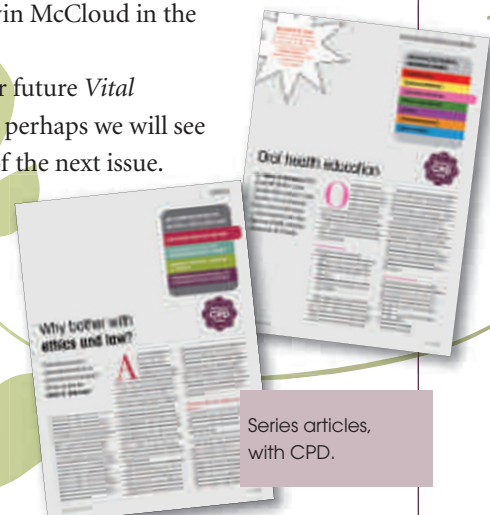
Series articles, with CPD.