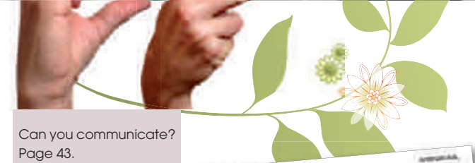
Can you communicate? Page 43.