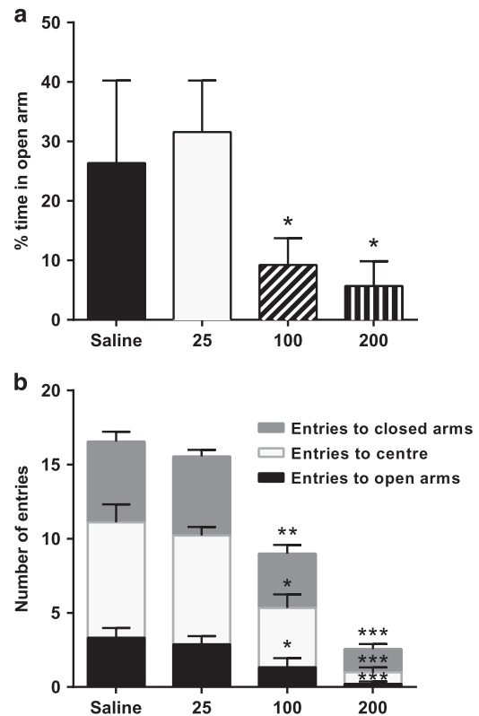
Figure 3. Elevated plus maze behavior of rats treated with saline (n=9), (-)-OSU6162 (25 μmol kg -1 ; n=9), (-)-OSU6162 (100 μmol kg -1 ; n=9), or (-)-OSU6162 (200 μmol kg -1 ; n=9). (a) Percentage of time spent on the open arms. (b) Entries to open arms, closed arms and center. *P < 0.05, **P < 0.01, ***P < 0.001 versus saline.

enhanced locomotion during 10–20 min after administration (Figure 2).