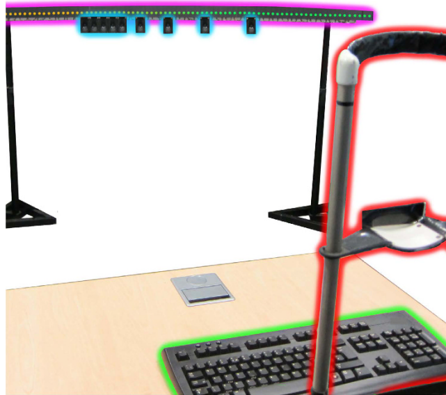
Figure 3. The Ring of LEDs and Speakers. During the experiment, the speakers (outlined in blue) were hidden using an acoustically transparent curtain to ensure that participants were unaware of their locations. Participants maintained their head position fixed at straight ahead, using a chin rest (outlined in red), and entered responses using a dial (not visible) and keyboard (outlined in green).

location estimates. However, inconsistent with reliance on prior knowledge, we found that biases towards the periphery also increased with eccentricity, despite no corresponding increase in uncertainty. We also saw significant effects of training: Both biases and variability declined in during- and after- training phases compared to before- training.