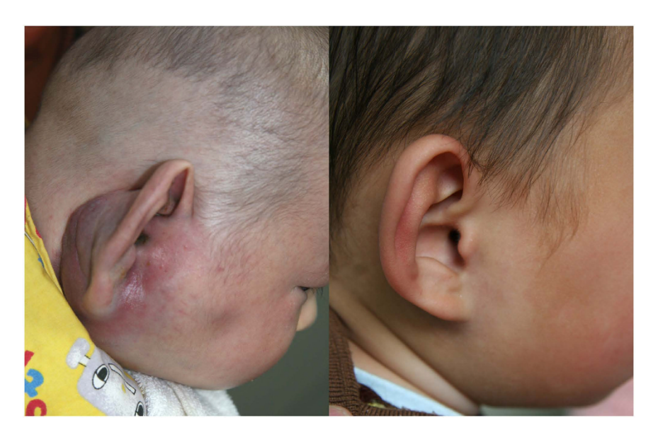
Figure 3. Response of refractory KHE with KMP to IFN- \alpha therapy in patient No. 8. (A) Before the onset of IFN- \alpha therapy at an age of 3 months; (B) Twenty months after the end of IFN- \alpha therapy at an age of 29 months. Complete regression in the size and symmetric appearance was obtained without recurrence.