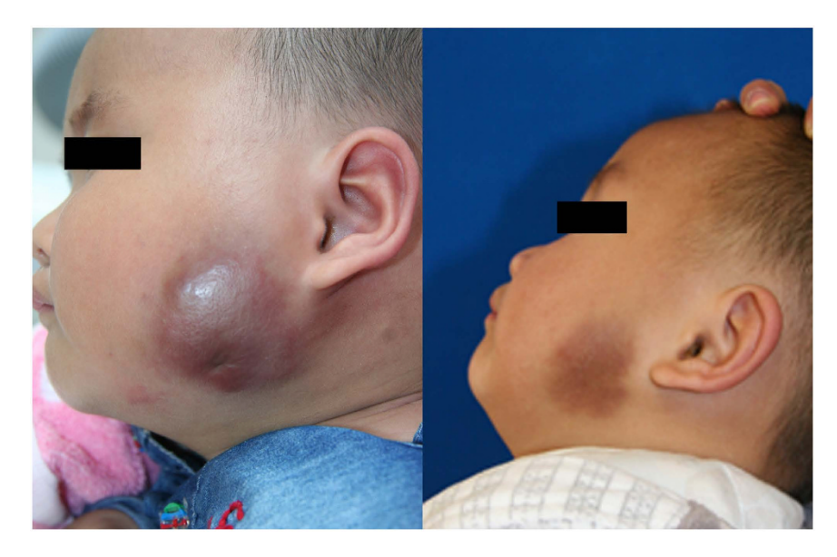
Figure 2. Response of refractory KHE without KMP to IFN- \alpha therapy in patient No. 1. (A) Before the onset of IFN- \alpha therapy at an age of 6 months; (B) Three months after the end of IFN- \alpha therapy at an age of 18 months. Obvious discoloration and regression in tumor size were observed.