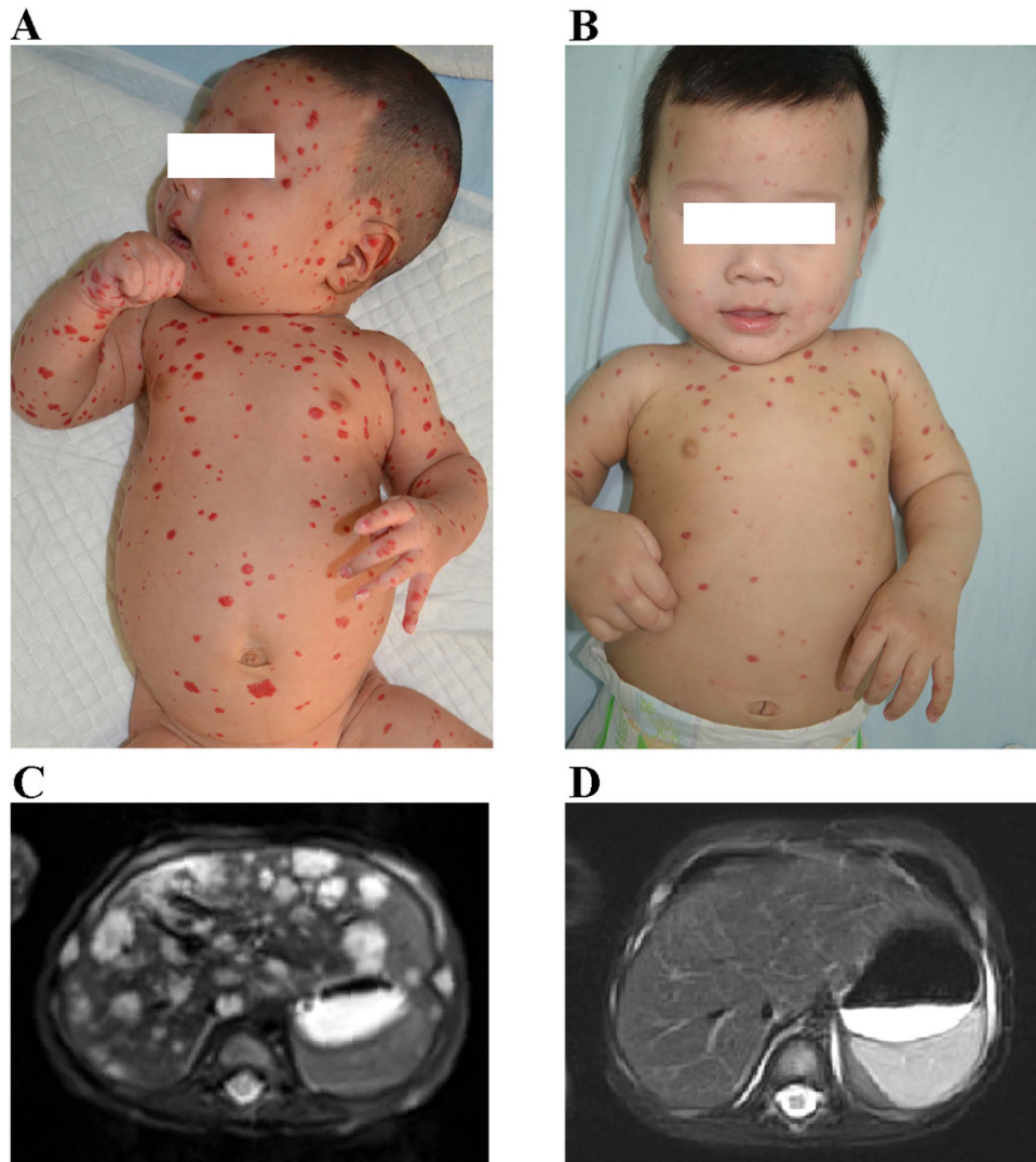
Figure 3. Propranolol treatment for multifocal IH in a 1.5-month-old boy (Patient #11 in Table 2). Clinical photographs of cutaneous IHs, 1 day before propranolol treatment (A) and 6 months after the start of treatment (B). T2-weighted axial MRI showed MHH, 1 day before propranolol treatment (C) and 6 months after the start of treatment (D).

Of note, the two patients who died in the present series were initially treated with prednisone, but both of them demonstrated an insufficient response. Although they further received vincristine or embolization, these treatment approaches failed to inhibit tumor progression. Therefore, in certain cases, the prompt application of the appropriate therapy is necessary to promote tumor involution and control the life-threatening critical conditions.