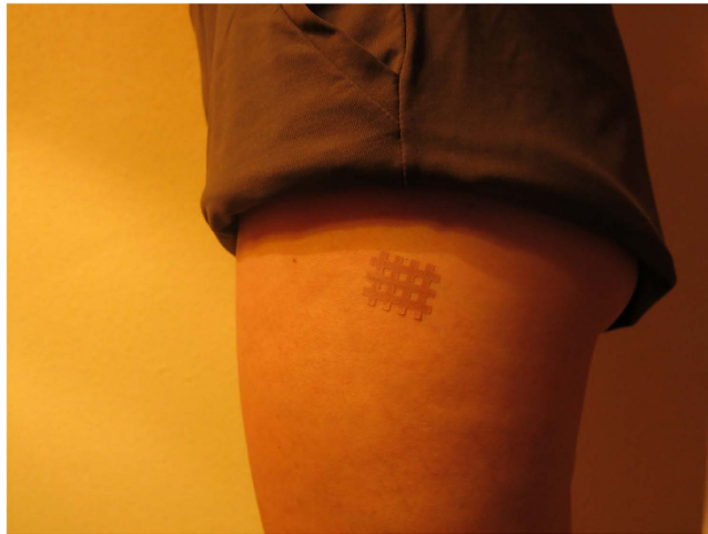
Figure 3. Spiral Tape in the greater trochanter area (control group). The copyright holder (ATENA PRODUCTOS FARMACÉUTICOS, S.L.) has approved the utilization of this figure.

Pain was measured in different parts of the body (abdomen, legs, lumbar area and head). Because we were using data from two menstrual cycles before and after the intervention, pain scores and number of tablets were averaged for the two months of each period (pre and post-intervention). Regarding the symptoms in post-intervention, participants were considered to have suffered them if they appeared at least once in the two menstrual cycles. The participants had to answer if the symptoms had appeared, this is to say, this variable was assessed qualitatively (symptom YES, symptom NO).