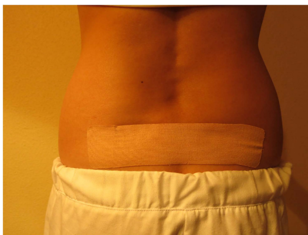
Figure 2. Medical Taping Concept in the low back area (intervention group). The copyright holder (ATENA PRODUCTOS FARMACÉUTICOS, S.L.) has approved the utilization of this figure.

The material for both groups can tolerate being wet once applied and it dries fast and easily, thus avoiding damp patches and skin alterations. This allows the user to wear them for periods of 3 to 5 days with no need to remove them. The materials are to be placed once the menstrual pain begins and are to remain adhered for about 4–5 days until the pain disappears.