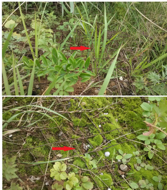
Figure 1. Bare metal mesh on the surface.

slope surface lacks the support stability 9 . Spraying base material on soil dressing to protect slopes is the slope ecological restoration is a technique commonly adopted in China. Artificial soil used for spraying is composed of broken rock, farmland soil, straw, compound fertilizer, water-retaining agent and binder (commonly used binders include Portland cement, organic glue, and asphalt emulsifier) based on the given proportion. The technical flow is: laying iron wire net on rocks first, then fixing iron wire net with rivet and anchor bolt, and spraying artificial soil containing seeds on slopes through special sprayers at last. No.14 rhombic metal net galvanized sufficiently is mostly employed, standard of meshes 5\text{ cm} \times 5\text{ cm} and diameter 2 mm. The metal net can make the soil substrate form a lasting holistic plate on the surface of rock. The metal net will be corroded in soil for the soil itself is the electrolyte, and the corrosion degree depends on the feature of soil. Evaluation of soil corrosion factors is very important for assessment of metal mesh erosion caused by soil and eliminating hidden dangers of landslide.