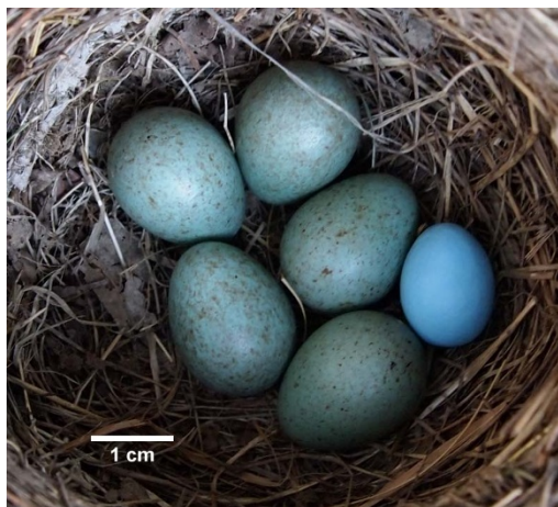
Figure 1 | We introduced a single blue non-mimetic model into blackbird (depicted here) and song thrush nests in their native European and introduced New Zealand ranges.

determined whether blackbirds and song thrush were equally likely to remain close-by as foreign egg models were added to their nests, by measuring how far females flew from their nests after flushing (hereafter, fleeing distance sensu 13 ). Second, we determined if hosts' responses to experimental parasitism can be predicted by whether they were flushed from their nest at the time of experimental manipulation. Third, we assess whether this potential confound would change the previous conclusions 14 . If flushing predicts host response, our results will have broad implications for the design and interpretation of studies of brood parasite-host coevolution.