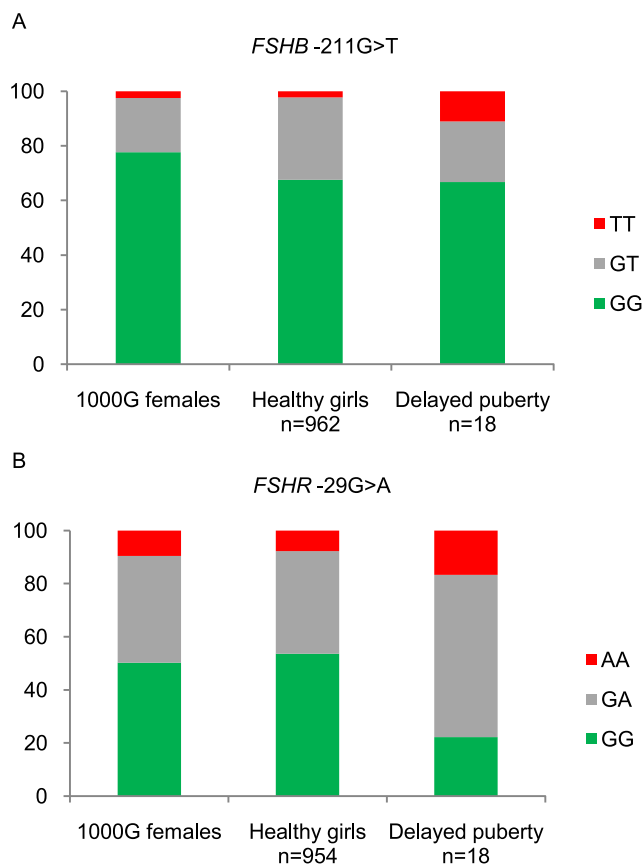
Figure 2 | Distribution of genotypes FSHB -211G>T (A) and FSHR -29G>A (B) in Caucasian females (data from 1000 Genomes: www.1000genomes.org), as well as healthy Danish girls and 18 patients with delayed puberty from the present study population.

Upstream of the pituitary gland, reactivation of the hypothalamus and its connecting neurones drives the onset of puberty through the hypothalamic-pituitary-gonadal (HPG) axis. Hypothalamic GnRH is controlled by multiple pathways; e.g. kisspeptin, neurokinin B, and metabolites from adipose tissue 8,35 . Much focus has therefore been placed upon childhood growth and adiposity in relation to pubertal timing. BMI is a crude estimate of fat mass, and the effect of FSHR -29G>A and FSHB -211G>T was not driven by differences in BMI in the present study. Thus, our findings indicate that even after central reactivation of the hypothalamus, down-stream processes in the HPG axis influence the peripheral attainment of secondary sexual characteristics.