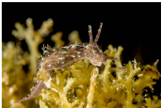
Figure 1 | Stylocheilus striatus .

distribution as a specialist grazer on the toxic cyanobacterium, Lyngbya majuscula 14 . We examined whether developmental success (eggs completing organogenesis within five days of incubation), hatching (embryos hatching after five days of incubation), and survival after hatching were affected by repeated boat-noise exposure during early development in S. striatus . We predicted that development of embryos would be compromised by increased noise and that those that survived would take longer to hatch and have higher mortality after hatching.