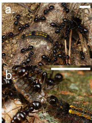
Figure 1 | Larvae of Nudina artaxidia on a Zelkova serrata trunk. (a), Following a Lasius ( Dendrolasius ) capitatus trail; (b), stealing honeydew from a giant scale insect, Drosicha corpulenta , being attended by L. (D.) nipponensis . Each scale bar represents 5 mm.

insect secreted a honeydew droplet, the larva sucked it up (Fig. 1). The mean numbers of the beating behaviour per minute were 9.5 for Individual A and 9.8 for Individual B, respectively, and were not significantly different between the individuals (Mann-Whitney's U test, P = 0.936 ) (Fig. 2). Although most of the surrounding ants did not react in a hostile manner toward the feeding larva, a few ants showed threat behaviour (but not attack behaviour). This honeydew-feeding behaviour was performed for about 10 minutes. On two other occasions, on 24 July 2010 at Jyo-yama and on 12 September 2011 at Satoyamabe, we found a larva feeding on lichens growing on tree bark by the side of an L. nipponensis trail. In these instances, the larva temporarily left the ant trail to feed on lichens growing within a few centimetres of the ant trail, and after feeding, each larva returned to the ant trail.