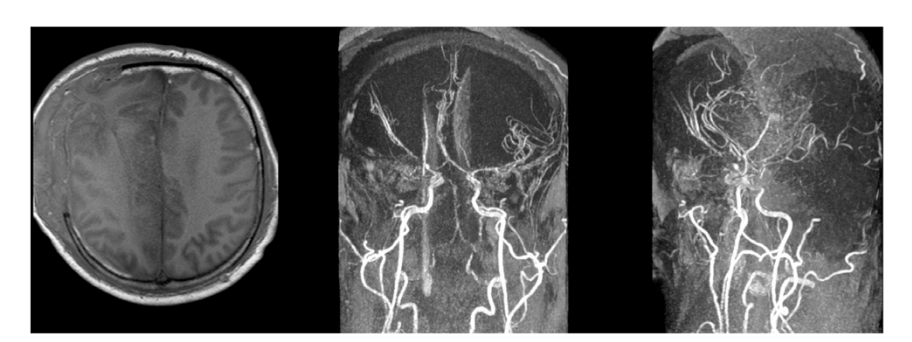
Figure 2 | MRI/MRA of a patient diagnosed with clinically diagnosed brain death. The T1-weighted axial image shows the situation after right-sided unilateral decompressive craniectomy following severe traumatic brain injury. MRA shows contrast medium in A3 and M3 segments. Compared with the contrast medium within the extracranial vessels an extremely slow intracerebral circulation is obvious.