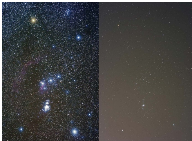
Figure 1 | Skyglow reduces the visibility of celestial objects for both the human eye and consumer cameras. The GLOBE at Night project works by assessing the visibility of stars near constellations like Orion, shown here. This image, entitled “Light pollution: it’s not pretty” was produced by Jeremy Stanley and is released under the CC BY 2.0 license ( http://commons.wikimedia.org/wiki/File:Light_pollution_It%27s_not_pretty.jpg ), access date 18 January 2013.

through both mechanisms (e.g. aerosols). The GLOBE at Night project avoids the two most important factors by limiting the observations to times when the moon is set, and requiring observers to record the cloud cover. The rest of the variables, however, introduce a systematic uncertainty of unknown size into the dataset. In addition to physical phenomena, additional variance is introduced by the observational experience of observers 16 , as well as through mistakes made by participants during the data submission process, such as entering an inaccurate location.