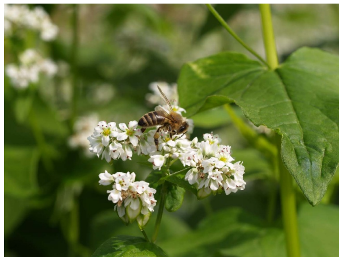
Figure 2 | Wild honeybees ( Apis cerana ) visiting buckwheat flowers ( Fagopyrum esculentum ).