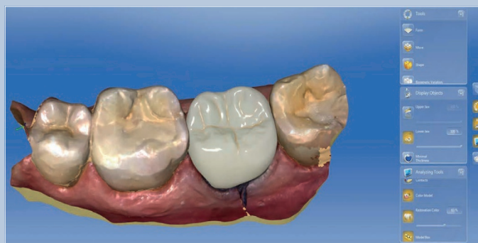
Fig. 1 The CEREC software upgrade means enhanced user comfort. An analysis function helps you to determine the tooth colour, and the sidebar directly shows all the available options