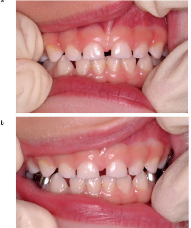
Fig. 3 The same child as Fig. 1. Anterior view of the dentition a) before the crown fit and b) 10 days after the crowns were fitted to teeth 84 and 74 (right and left 1st primary molars). Note that the occlusion has returned almost fully to its original state

in the United States was just 2.1 with a range of 0–10.<sup>30</sup> With such limited clinical experience in placing crowns it is easy to understand why graduating dentists are more comfortable placing amalgams and composites. It has been documented in the literature that when evaluating the same patient information and radiographs, general dentists are more likely to recommend multi-surface restorations for carious primary molars, while paediatric dentists are more likely to recommend preformed metal crowns.<sup>31</sup> This is unfortunate since general dentists carry out most dental care for children and the long-term prognosis of these crowns in the primary dentition is superior to multi-surface restorations.<sup>17,32,33</sup>