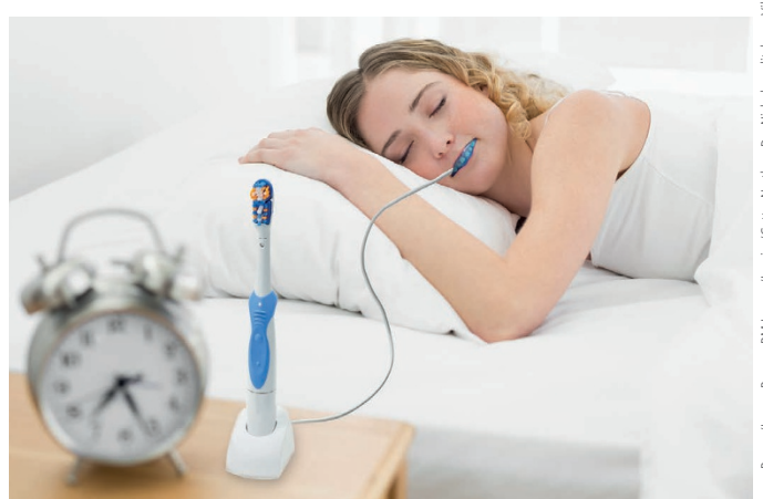
Get your grinding patients going today! Visit www.bruxbrushgrinder.co.uk.

Several studies have shown that one eight-hour sleep session with 73.2% of that involving teeth-grinding can charge an electric tooth-brush for up to one hour. Tests have shown that the Bruxbrush can be used in the patient's place of work. If the patient has an irritable colleague, a long meeting or a stressful day at work, tests highlighted a significantly increased energy production delivered to the mouthguard.