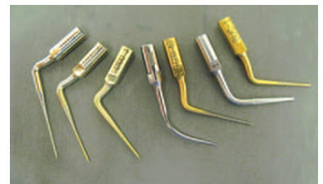
Fig. 2c A selection of commercial ultrasonic tips designed to remove dentine from the root canal system and facilitate file removal

aspect of the fractured instrument, these techniques are generally used in single-rooted teeth or straight roots (Figs 3a-c) and have limited application in narrow and curved segments of the root where there is reduced dentine thickness.