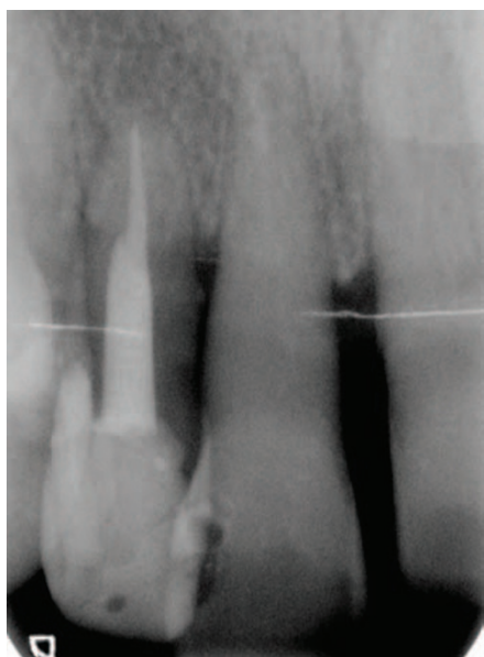
Fig. 3b Postoperative radiograph after removal of the instrument using a combination of ultrasonic agitation and a micro-tubule device