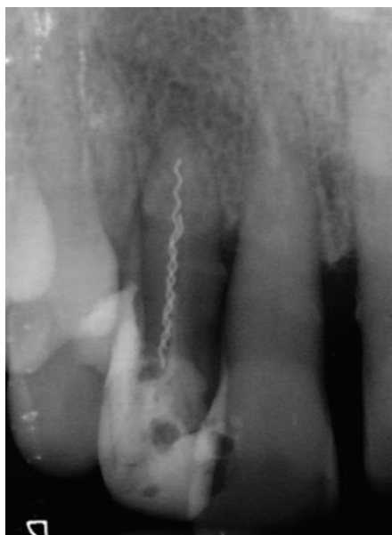
Fig. 3a Preoperative periapical radiograph of tooth 12 demonstrating a suspected fractured instrument in the canal