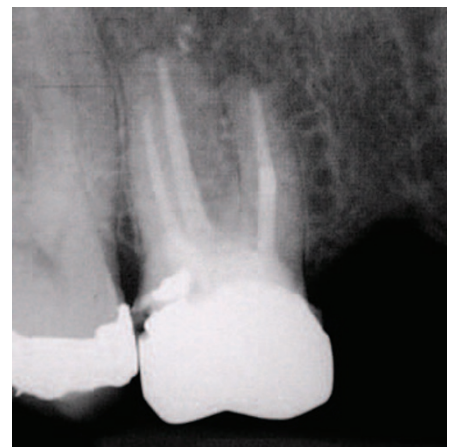
Fig. 1b Postoperative radiograph after removal of the fractured instruments in 16 and completion of the root canal treatment. In this case removal of the fractured instruments using a ultrasonic agitation did not necessitate significant dentine removal from the canal walls