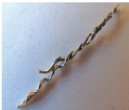
Fig. 3c Photograph of fractured segment revealing two separate instruments intertwined

by a modified Gates–Glidden drill although ultrasonic tips can be used), which creates sufficient space to allow the specialised ultrasonic tips to trephine around the coronal aspect of the fragment and in so doing agitating, loosening and unwinding the fractured instrument. 31 It is generally recommended that a cotton wool plug is placed in the other canal orifices to prevent the removed segment lodging in another canal. Ultrasonic agitation of a modified or unmodified pre-curved K-file has also been described as an alternative method to the use of a specialised tip to create a trough around the coronal aspect of the fragment. 13 It is suggested that the use of a K-file is more versatile (large array of file sizes), more economic and has particular application where roots are narrow and root dentine thickness limited. 29