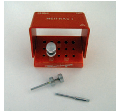
Fig. 2a The Meitrac I Endo Safety System for removal of fractured instruments. This micro-tube device is designed to engage the coronal aspect of the file facilitating removal

The success of certain devices has been well documented in the case of ultrasonic removal, 8,13,17,25 but unfortunately many of the microtube systems have no such scientific evaluation; this presents problems for clinicians in assessing their relative efficacy. All of the techniques share similar problems of excessive dentine removal, weakening of the root structure, predisposition to ledging, perforation or root fracture and possible extrusion of the fragment through the apex. 12,13,18,19,30 Furthermore, since successful removal requires visualisation and straight-line access to the coronal