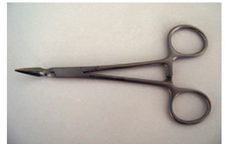
Fig. 2b Steiglitz forceps for removal of easily accessible fragments generally within the pulp chamber