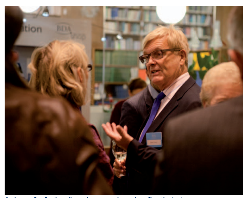
A chance for further discussion over mince pies after the lecture