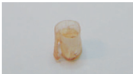
Fig. 3 The foreign body removed from the tooth

contact point. Examination of the object revealed some kind of plastic straw like tubing around 4 mm long and 5 mm in diameter (Fig. 3).