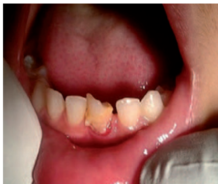
Fig. 1 The affected tooth with its calculus-like covering

A vertical cut was made along the length of the film labially using a scalpel and the object was slid out through the