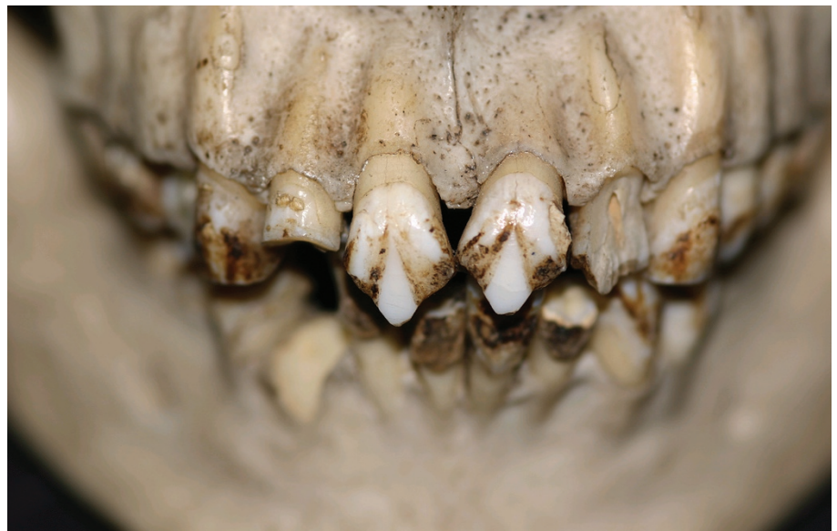
Fig. 2 Dental mutilations (detail)