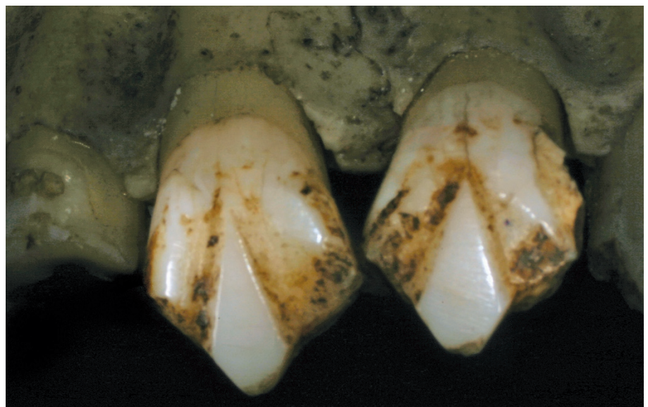
Fig. 3 Dental mutilations (detail)