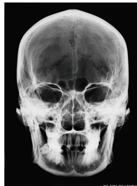
Fig. 5 Skull. Radiographic study

using various colouring substances or inlays. These patterns can also be found with some frequency among the Sunda populations of the Pacific. 8,14