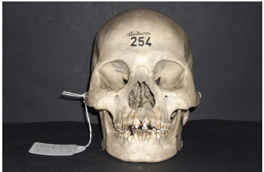
Fig. 1 Skull

Dental mutilation is unusual and uncommon in India. Among these populations, one can find techniques of dental sharpening and carving in the form of grooves on the labial faces, which are later dyed