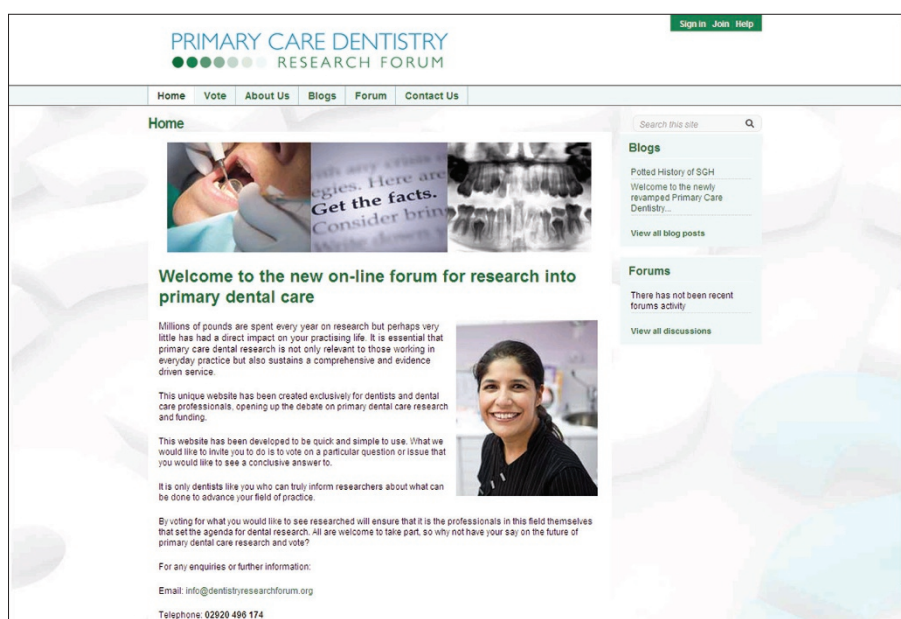
Fig. 1 The new website homepage

A decision was taken by the Trustees to procure new software for the website which would allow registrants to vote for