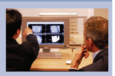
team. Upcoming course dates for 2009 are 26 June, 31 July, 28 August, 25 September, 30 October and 27 November. Reader response number 50

The company, which manufactures products such as the PaX-Reve 3D, is also offering computed tomography user training courses for the dental