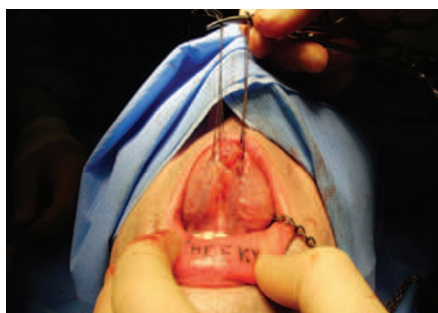
Fig. 2 Repaired ventral surface of tongue