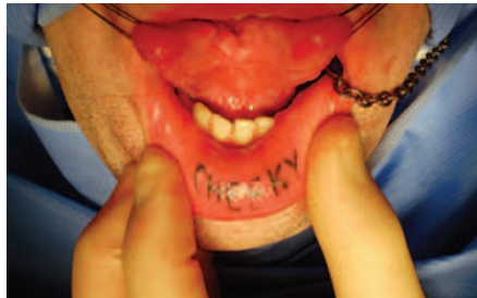
Fig. 1 Bifid/forked tongue injury

There can be several, even life threatening, complications to tongue piercings and their subsequent removal, 1 but removal by canine guidance is not a commonly reported method.