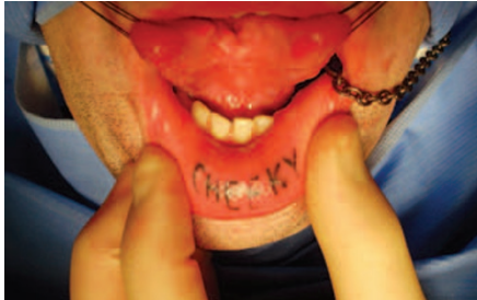
Fig. 1 Bifid/forked tongue injury

There can be several, even life threatening, complications to tongue piercings and their subsequent removal, 1 but removal by canine guidance is not a commonly reported method.