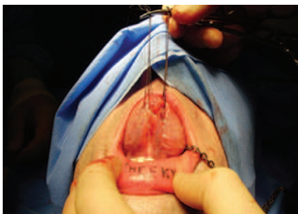
Fig. 2 Repaired ventral surface of tongue