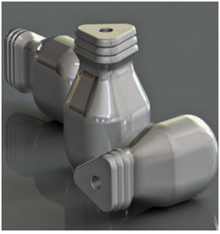
The toothbrush combines a disposable brush-head with a handle that is similar to that found on a screwdriver

Mr Hodgkison hopes to have his product on the market within the next five years.