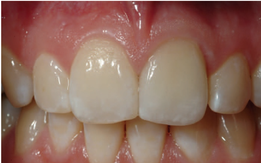
Fig. 6 Final restoration after six months showing excellent cervical aesthetics with invisible equigingival margins

preparation is generally more aggressive and into dentine (~1.2 mm labially and ~2 mm incisally). This also allows for adequate porcelain thickness to provide increased strength and to develop the necessary aesthetics (Figs 1-4). The concept of a dentine bonded crown has been discussed by Burke et al. as arguably an ideal restoration. 30,31 It differs from that of a 360° porcelain veneer where the tooth is previously unrestored and all attempts are made to remain in enamel.