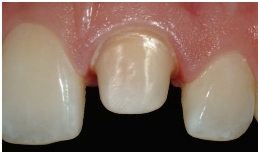
Fig. 3 Tooth preparation with equigingival margins in enamel. Note smooth preparation with no sharp angles