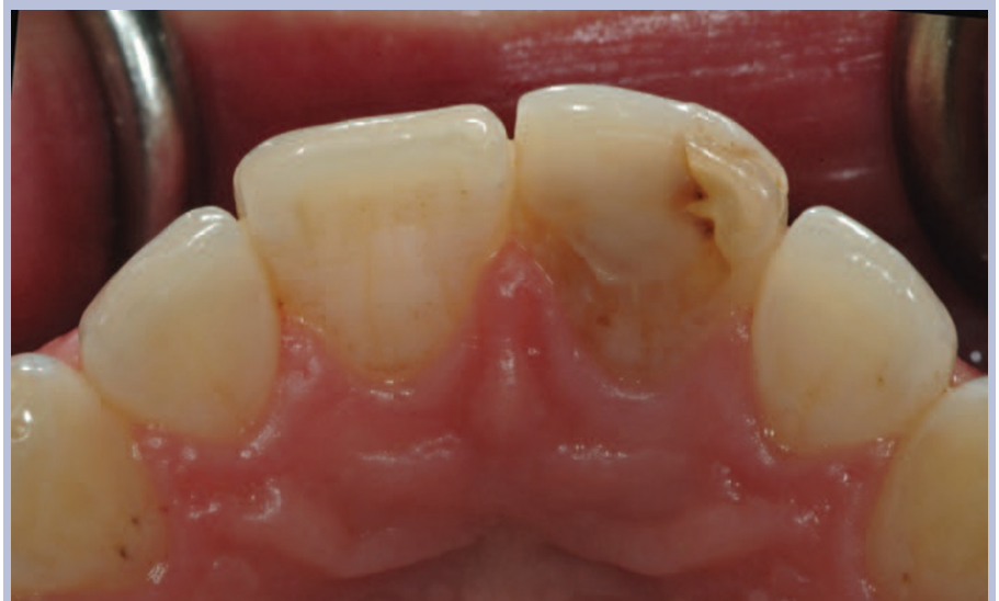
Figs 1-2 Pre-op views of discoloured composite restoration on endodontically treated tooth 21. Note the entire palatal surface formed from a composite resin restoration

based on the resistance form and margin location of the tooth preparation.