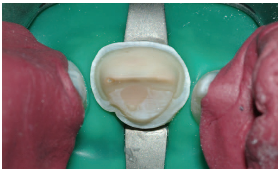
Fig. 5 Rubber dam applied to tooth. Note exposure of all enamel margins and optimal moisture control