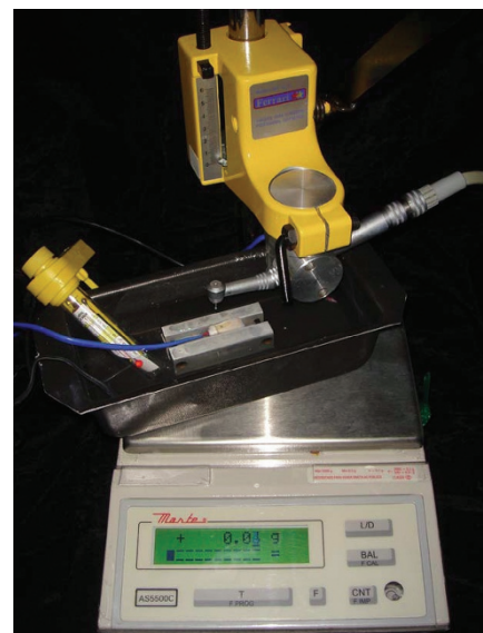
Fig. 1 Tooth in position on the laboratory scale before starting the cavity preparation

All specimens had a thermal-conductive paste inserted into the pulp chamber to facilitate the heat conduction from the chamber walls to the thermocouple. The active apex of T thermocouple (copper (+) x constantan (-)) was inserted in a way so that was in direct contact with the internal buccal dentine wall, next to the place where the tooth was prepared. The pulp chamber was filled out and the apical portion of the tooth was sealed with an adhesive mass (Multi-Tak/Pritt) to firmly hold the thermocouple in the correct position. The thermocouple was positioned at a height of 5 mm, corresponding to the standardised measure presented previously. The temperature rises were recorded with a data collector