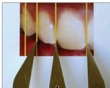
Fig. B A Golden Mean Gauge superimposed on the enlarged section of the central and lateral incisor

would seem that there was an error in their measurements.