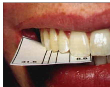
Fig. D A photograph of a stiff paper grid in the golden proportion for an accurate, but easy evaluation of the golden proportion straight on the upper incisors

Figure B shows the golden mean gauge superimposed on an enlargement of the same photograph as above.