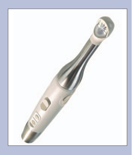
and USB2 equipped PC or laptop. Reader response number 60

The USB camera is designed to sit next to your high speed handpiece. It has dual capture buttons for right or left hand use, plus a newly designed slide focus that lets the operator adjust from macro to full smile with a touch of the finger. Finally it is sharper because of its advanced LED optics and digital technology. The Icon can be used with any digital imaging software