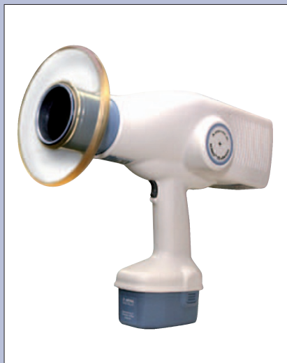
Reader response number 62

The Nomad is a new hand-held intra-oral X-ray system which is a practical and high-tech device according to Clark Dental. The device has appeared on the US TV-show CSI: New York and was used during the aftermath of Hurricane Katrina. It weighs less than 4 kg and is cordless for portability, can produce 100+ exposures from one of two rechargeable batteries that are included, is compatible with digital sensors and traditional X-ray film and has a simple control panel for improved accessibility.