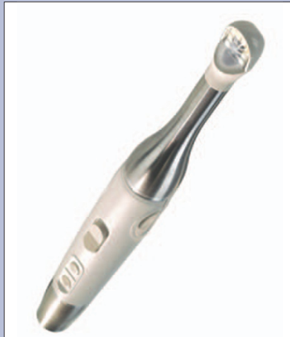
and USB2 equipped PC or laptop. Reader response number 60

The USB camera is designed to sit next to your high speed handpiece. It has dual capture buttons for right or left hand use, plus a newly designed slide focus that lets the operator adjust from macro to full smile with a touch of the finger. Finally it is sharper because of its advanced LED optics and digital technology. The Icon can be used with any digital imaging software