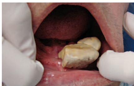
Fig. 1 A hard tissue mass covering the left side of mandibular anterior alveolar ridge

mandibular region. Examination showed an apparently edentulous mouth with a hard tissue formation of 4 cm covering the left side of the mandibular anterior alveolar ridge extending over the facial and lingual gingiva (Fig. 1). Radiographs revealed deposits completely covering all surfaces of two remaining teeth (Fig. 2). The diagnosis of dental calculus was made and the teeth were extracted. One week later the patient showed complete healing of the alveolus.